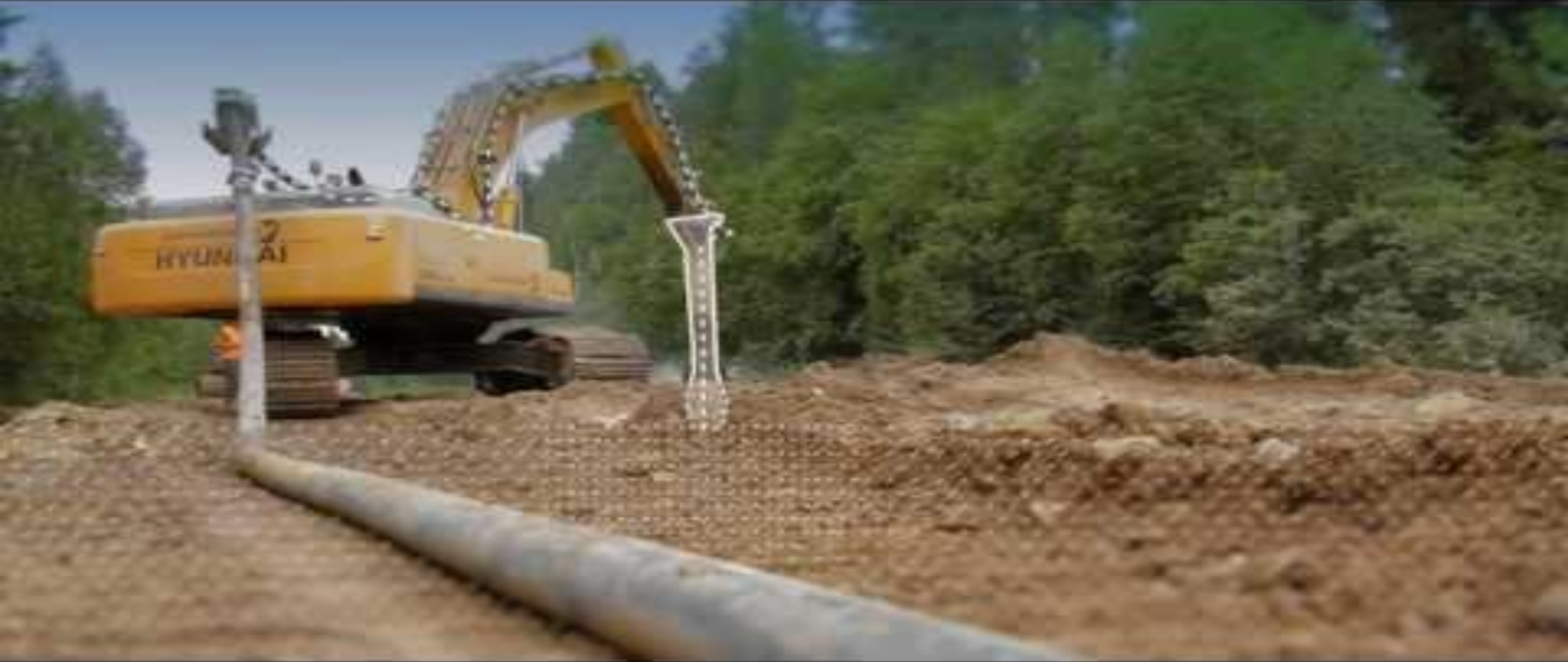
LIFE Baltic networking meeting 2018, Klaipeda, 20.09.2018.